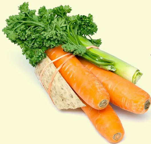
BABY SOUP VEGETABLES