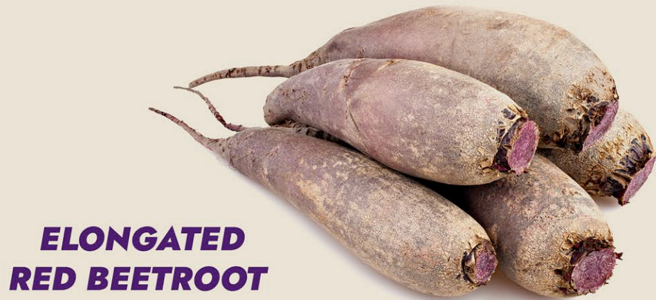
ELONGATED RED BEETROOT