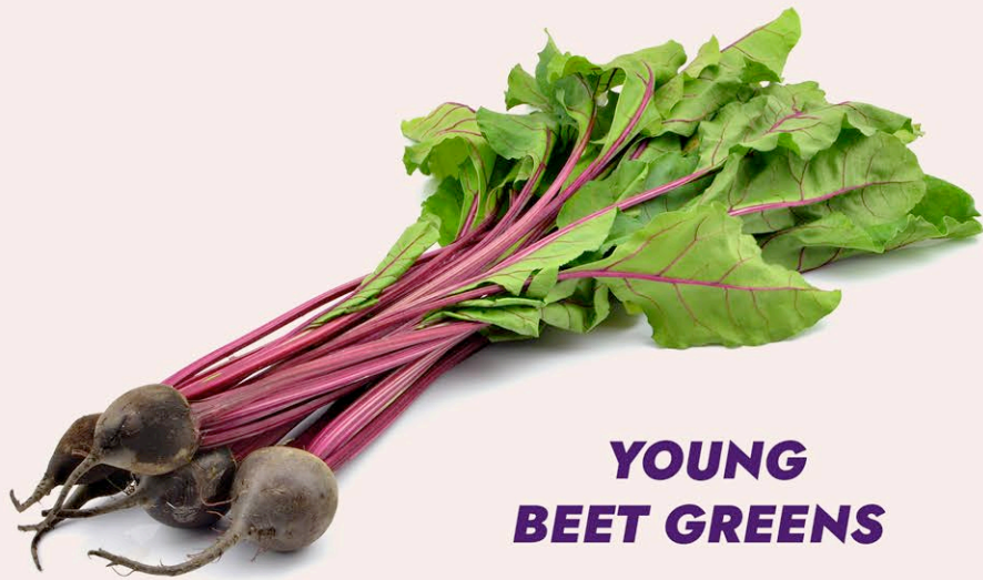
YOUNG BEET GREENS